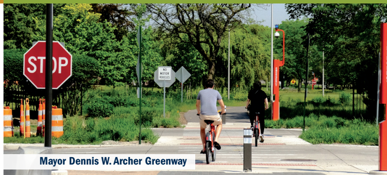
Mayor Dennis W. Archer Greenway

The Mayor Dennis W. Archer Greenway provides east side residents with safe and convenient access to the Detroit Riverfront along a beautifully-landscaped paved pathway.