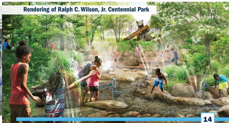
Rendering of Ralph C. Wilson, Jr. Centennial Park

West Riverfront Park closed to the public in summer 2022 as the park prepares for its transformation into Ralph C. Wilson, Jr. Centennial Park , which will open in 2025.