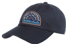
#1 Riverwalk Baseball Cap