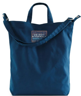
#1 Riverwalk Canvas Bag

There's something for the entire family inside this special box of Riverfront gifts and unique summer activities!