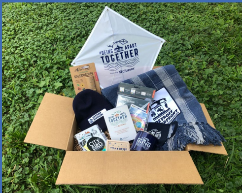
2020 Package - see page 3 to check out our new items!