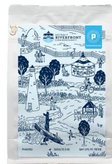
Detroit Riverfront Populace Coffee