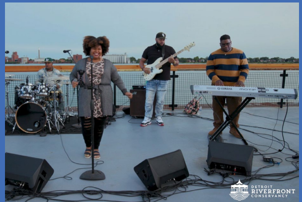
2020 Virtual Concert

We're bringing the Detroit Riverfront community a joyful evening of genre-spanning music, broadcast from our parks and greenways virtually on Facebook. With over 4,000 viewers of our 2020 concert, we're thrilled to create another special evening of entertainment, where viewers will get to tune-in and vote for their favorite performers. The winning band will receive a coveted Main Stage spot on a future River Days.