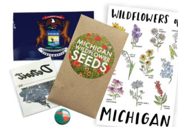
City Bird Grab Bag