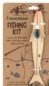
Huckleberry Fishing Kit