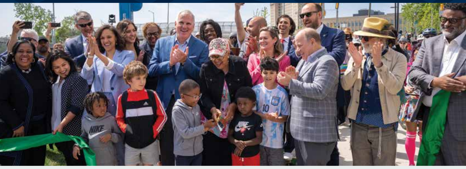
Issue 21 / Q3 / 2023